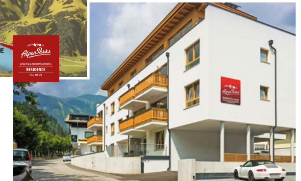
AlpenParks Residence Zell am See